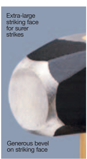
Extra-large striking face for surer strikes